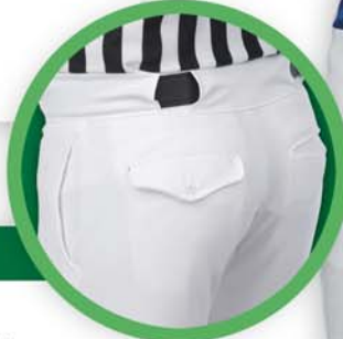
Set-In Back Pocket with Button Flap