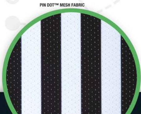
PIN DOT™ MESH FABRIC