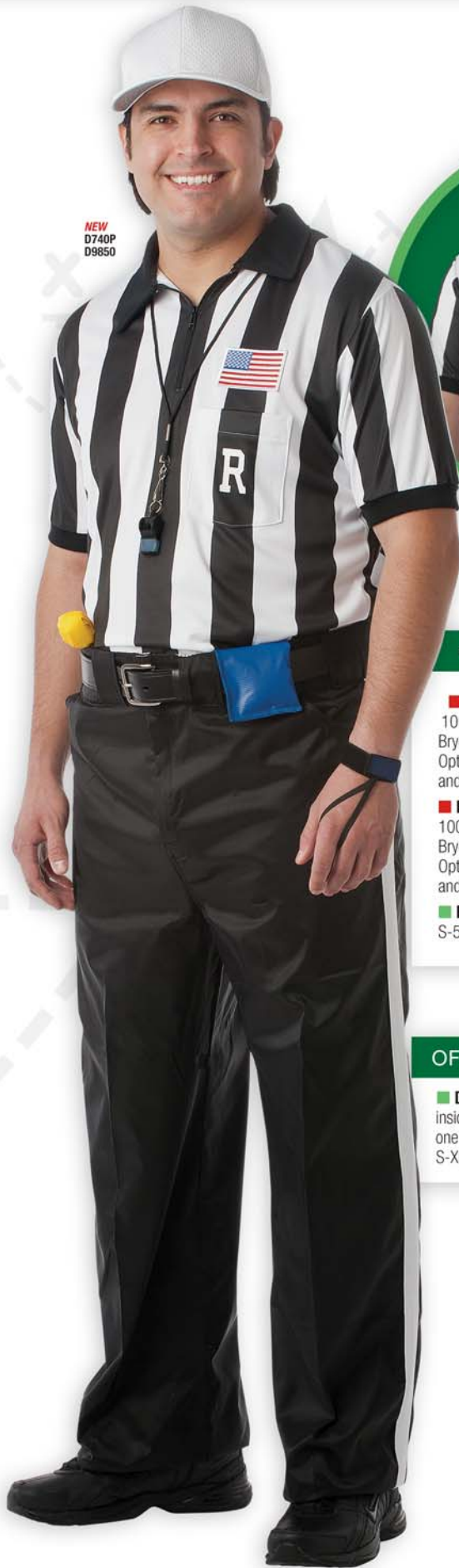
NEW D740P D9850