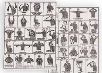
DB3503 (Front, Back)